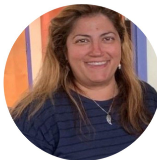
Head of Guidance