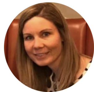
Head of English and Business